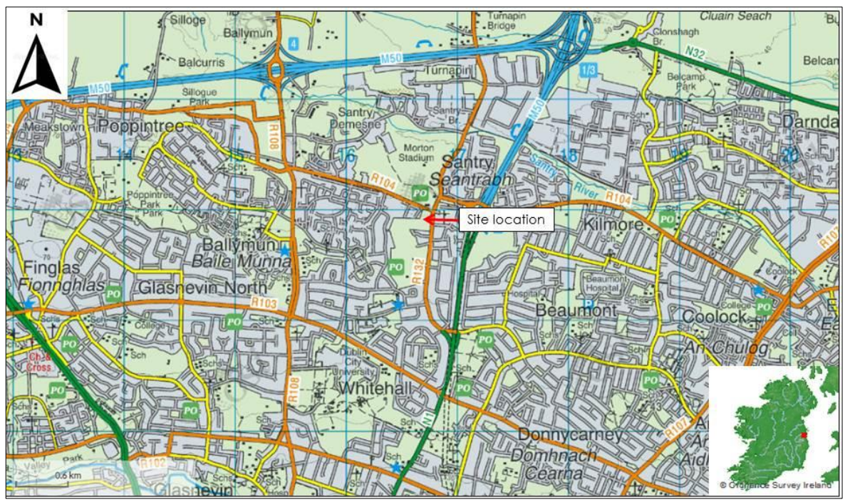
Figure 1 Site Location Map, red arrow

Ash Ecology and Environmental Ltd (AEE) was commissioned by Enviroguide Consulting to carry out a bat survey at a site located along Swords Road, Santry, Dublin 9; see Figures 1. An aerial photo of the site with surrounding habitats is shown as Figure 2 with a close up aerial shot as Figure 3. This is currently a live retail site with buildings that will require demolition to facilitate a proposed SHD housing development, see Figure 3. In that regard a bat survey was required to assess any bat usage on the site.