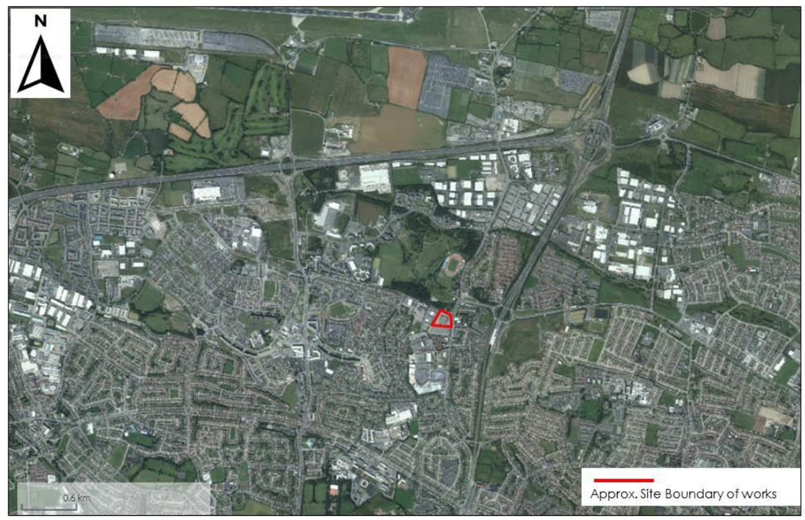
Figure 2 Aerial Photo of Site and Surrounds