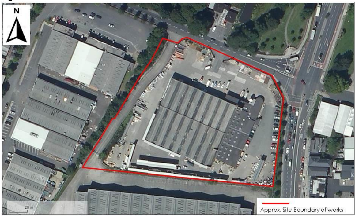
Figure 3 Aerial Photo of Site